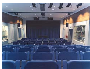
Small Theatre Interest/Priority Rating High Med Low Not