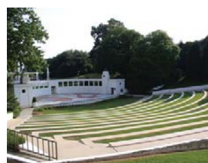
Amphitheater Interest/Priority Rating High Med Low Not