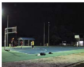
Night-lit Outdoor Court Interest/Priority Rating High Med Low Not