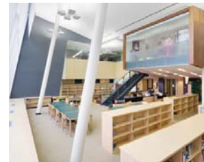
New Community Library Interest/Priority Rating High Med Low Not