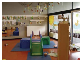
Childcare Interest/Priority Rating High Med Low Not