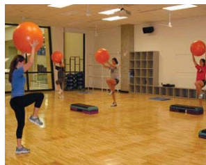
Multi-Purpose Room Interest/Priority Rating High Med Low Not