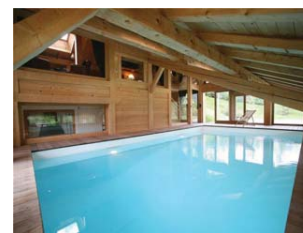
Indoor Swimming Pool Interest/Priority Rating High Med Low Not