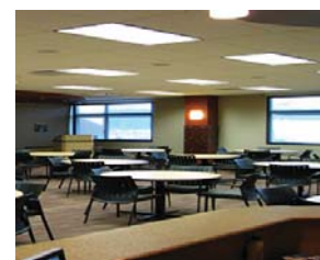
Meeting Room(s) Interest/Priority Rating High Med Low Not