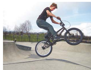
Bike/Skateboard Park Interest/Priority Rating High Med Low Not