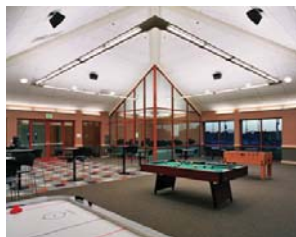
Teen/Senior Centre Interest/Priority Rating High Med Low Not