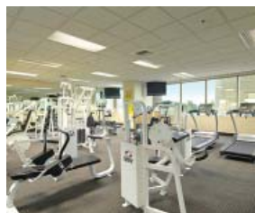
Indoor Fitness Facility Interest/Priority Rating High Med Low Not

Please provide a rating for each option on an interest/priority basis to allow for a more meaningful analysis of the community feedback received. Pictures are provided simply as possibilities to help your imagination and evaluation efforts. Have fun with it!